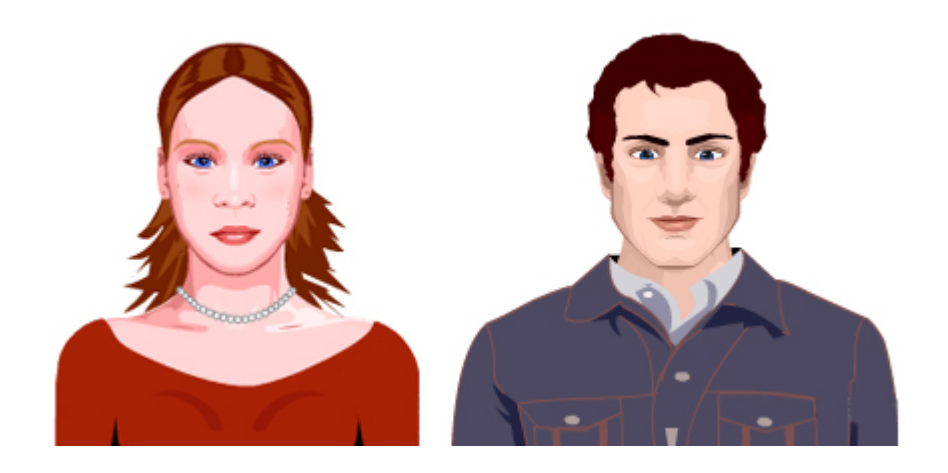
Figure 1 Conversational Characters Penelope and Alex.