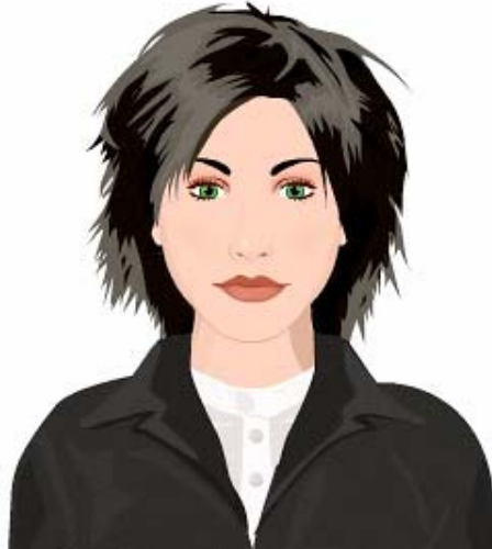
Figure 1. The pedagogical agent used in this study

Finally, although the agent's behavioral fidelity was simple, most real-world pedagogical agent deployments do not seem to employ behavioral fidelity beyond gaze and eye blinking. Using an agent with low behavioral fidelity therefore may yield results that would be comparable to what can be seen in the real-world.